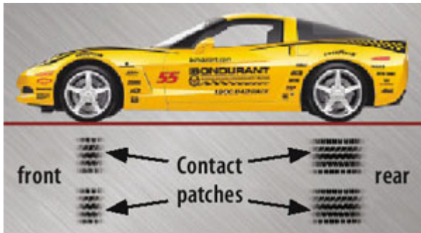
Bob Bondurant School of High Performance Driving

When you accelerate, weight transfers to the rear wheels from the front wheels. The car squats: The front of the car lifts, and the rear drops. Weight and friction increase for the rear wheels and decrease for the front wheels.