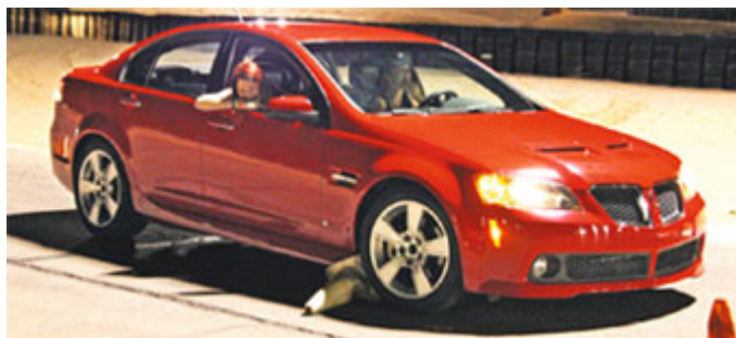
Bob Bondurant School of High Performance Driving

Ground school's over. It's time to get behind the wheel, starting with an exercise in extreme braking. Driving at 64 kilometers (40 miles) per hour and then 105 kph (65 mph), students practice slamming on the brakes. That gets them used to the strange pulsing sensation— thump! thump! thump! —in the brake pedal that's caused by the antilock brake system (ABS) . An ABS senses when the tires are beginning to skid and automatically reduces the braking force just enough so that the wheels start to spin again. It's important to keep the wheels spinning because that allows the driver to keep steering. Otherwise, the skidding car is guided only by its own inertia , the tendency to keep moving in the same direction—whether the driver likes it or not.