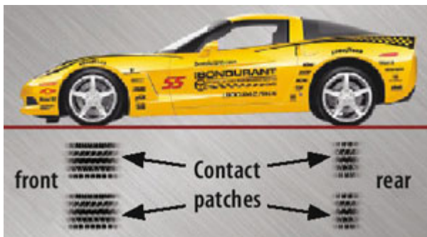
Bob Bondurant School of High Performance Driving

When you brake, weight transfers to the front wheels from the rear wheels. The car nosedives: The front drops, and the rear lifts. Weight and friction decrease for the rear wheels and increase for the front wheels.