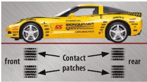
Bob Bondurant School of High Performance Driving

When you accelerate, weight transfers to the rear wheels from the front wheels. The car squats: The front of the car lifts, and the rear drops. Weight and friction increase for the rear wheels and decrease for the front wheels.